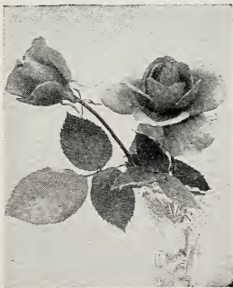
Gruss An Teplitz

MADAM BUTTERFLY —Exquisitely formed buds of Indian ochre with yellow at the base and those intermediate tones of clear, brilliant shades of coral pink, opening into deep, full flowers. Strong growing, free blooming.